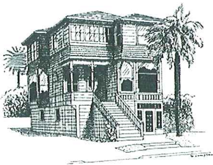
Our offices are located in Berkeley, in a circa 1900 Victorian Building.

RATE AND FEE STUDIES Our rate studies employ a cost-of-service approach and are designed to maintain the long-term financial health of a utility enterprise while being fair to all customers. We develop practical recommendations that are easy to implement and often phase in rate adjustments over time to minimize the impact on ratepayers. We also have extensive experience developing impact fees that equitably recover the costs of infrastructure required to serve new development. BWA has completed hundreds of water and wastewater rate and fee studies. We have helped communities implement a wide range of water and sewer rate structures and are knowledgeable about the legal requirements governing rates and impact fees including Proposition 218 and Government Code 66000. We develop clear, effective presentations and have represented public agencies at hundreds of public hearings to build consensus for our recommendations.